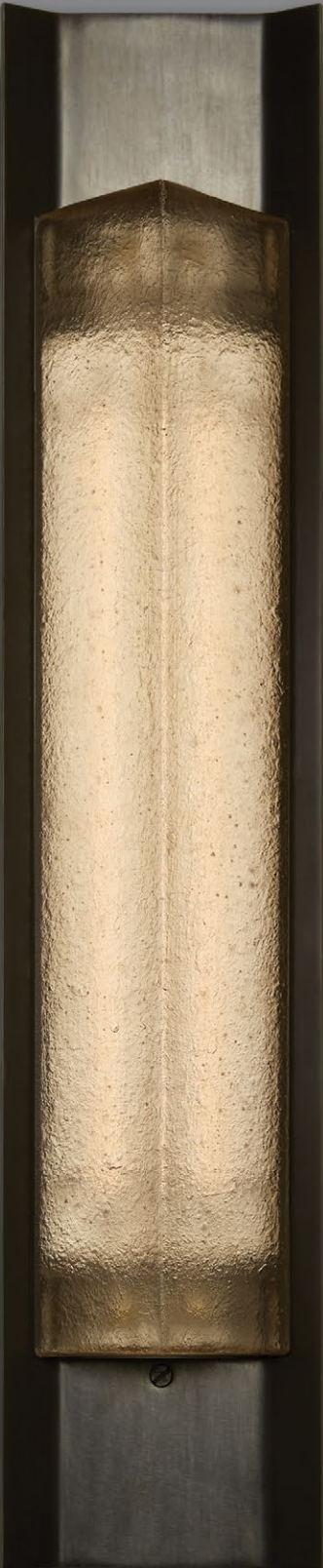
Shown: 22" model in Deep black oxide with Bronze cast glass.