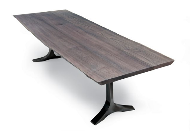
Maple in Rose Gray Finish and Blackened Steel Wishbone Base