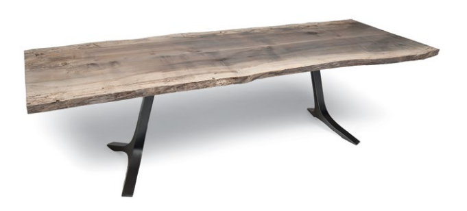
Oxidized Big Leaf Maple Finish and Blackened Steel Wishbone Base

* All TVM pieces are made to order, so custom configurations and sizing are encouraged. We work with maple, walnut and oak.