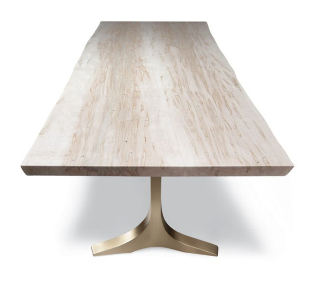
Ambrosia Maple Finish with Brass Wishbone Base