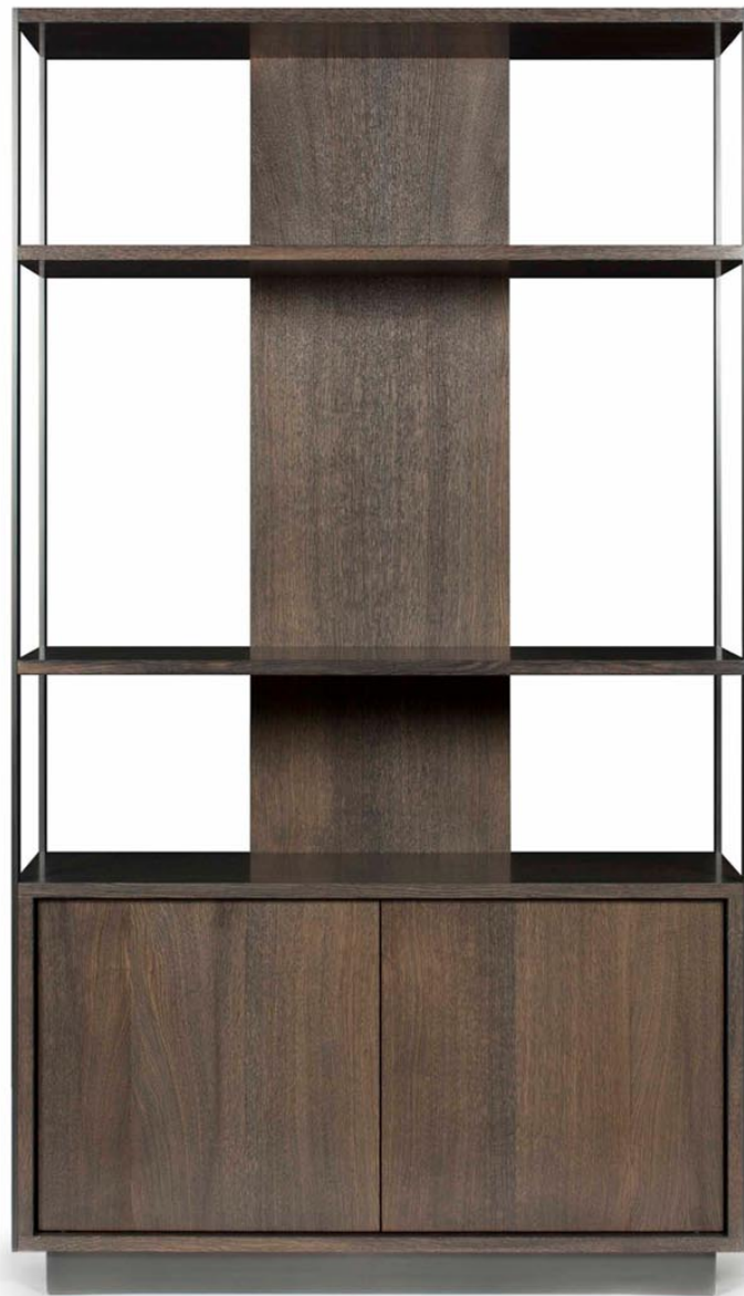
BLACKENED OAK BAR/BOOKSHELF

Shown in blackened oak and blackened steel