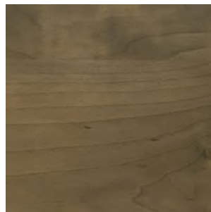
Table Top Material Options