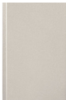
SS4: Brushed Stainless Steel