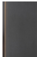
DRB: Dark Rubbed Bronze