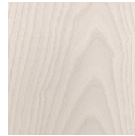
WA-WW: White Ash, Whitewashed