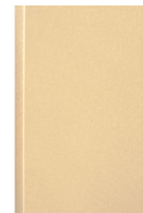
NRB: Natural Rubbed Bronze