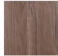
P-WAL: Walnut, Pale