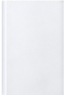
MOW: Matte Opaque White