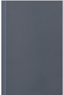
MOC: Matte Opaque Charcoal