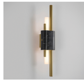
GREEN GUATEMALA | BRUSHED BRASS