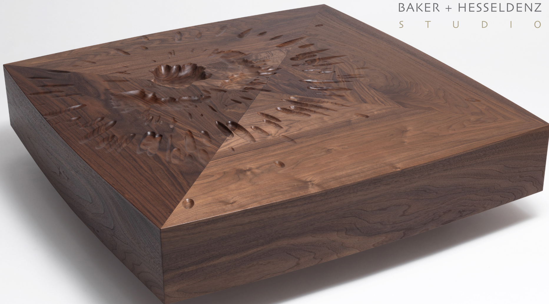
IMPACT COCKTAIL TABLE