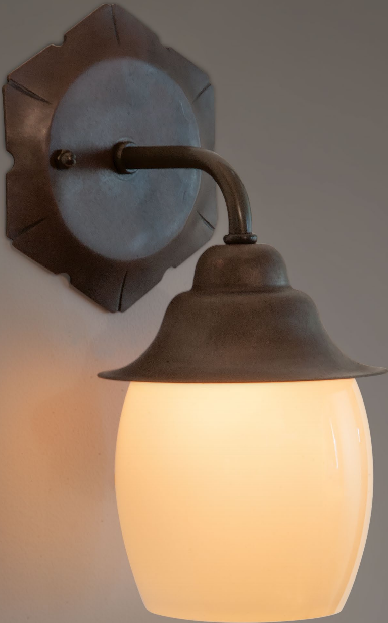
Shown: Deep brown oxide and Helbeige glass.